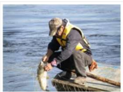
PROJECTS BY REGION

"An Indigenous community portal for climate change and health"