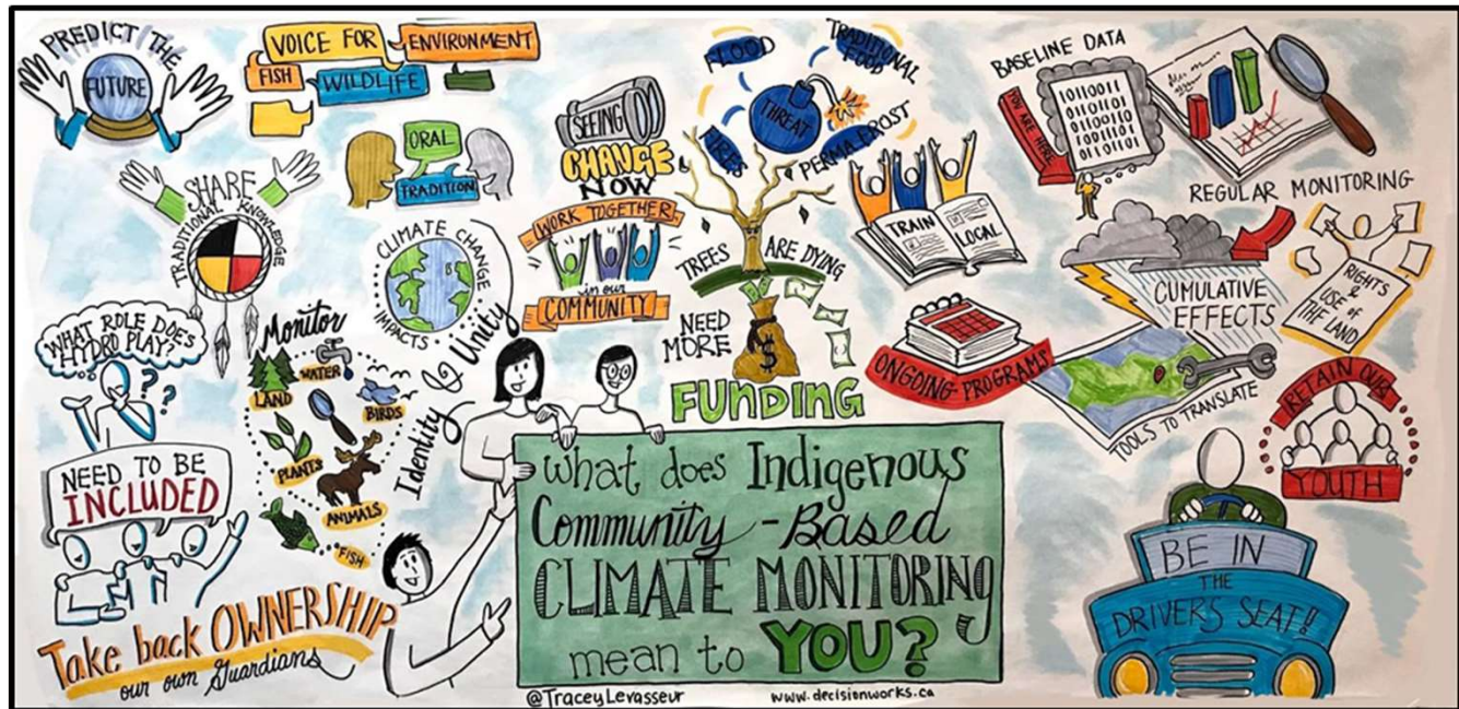
Tracy Levasseur, 2017

Indigenous Community-Based Climate Monitoring Symposium