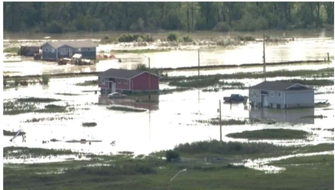
Flooded houses on Siksika Nation in 2013.